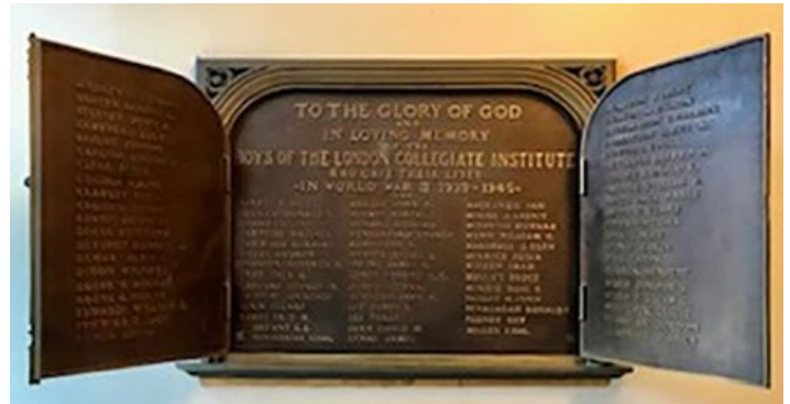
Central Collegiate Honour Roll