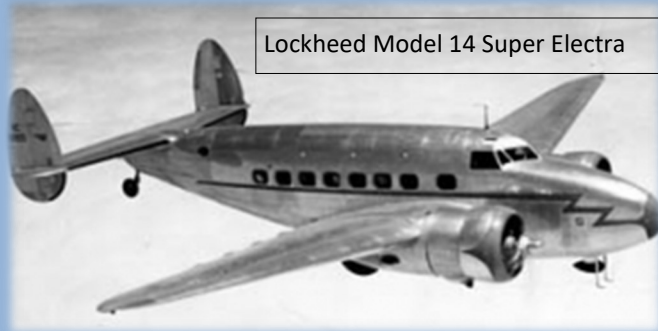
Lockheed Model 14 Super Electra

The Lockheed Hudson was an American-built light bomber and coastal reconnaissance aircraft built initially for the RAF shortly before the outbreak of the Second World War. The Hudson was a military conversion of the Lockheed Model 14 Super Electra airliner, and was the first significant aircraft construction contract for Lockheed Aircraft Corporation—the initial RAF order was for 200.