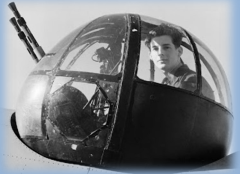
Ventura Mk.V, 113 Sqn, RCAF, 1944

Great care was required during take-off and landing. But it was fairly fast, especially at low level, and a fine aircraft to fly on instruments, in bad weather. The Ventura handled well with one engine out. While the Ventura was a superior combat aircraft than the Hudson, range was reduced. This was perhaps felt the most by the crews who had to make the transatlantic ferry flights: Even with extra fuel tanks added to a total of 1100 gallons, it could cross the Atlantic only with an average 25-knot tailwind.