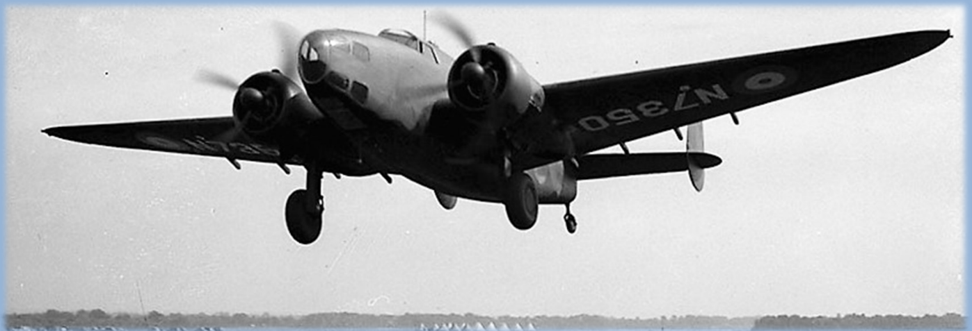
Mk.III Hudson, Torbay, Nfld., 1944

Flying aircraft directly to England from North America was an incentive of Lord Beaverbrook, then Minister of Aircraft Production in Britain. He had used his contacts in Canada with the Canadian Pacific organization to establish an entity called ATFERO (Atlantic Ferry Organization) to begin this. They used the airport built at Hatties Camp, Mile 213 on the Newfoundland Railway (now Gander) built as a joint project by England, Newfoundland and Canada. When completed it was the largest airport in the world, but had almost no facilities besides runways and a weather station. By the wars end it would be the largest airbase in Canada with RCAF, RAF and USAAF sections.