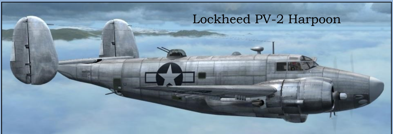
Lockheed PV-2 Harpoon