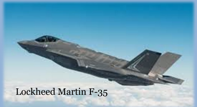
Lockheed Martin F-35