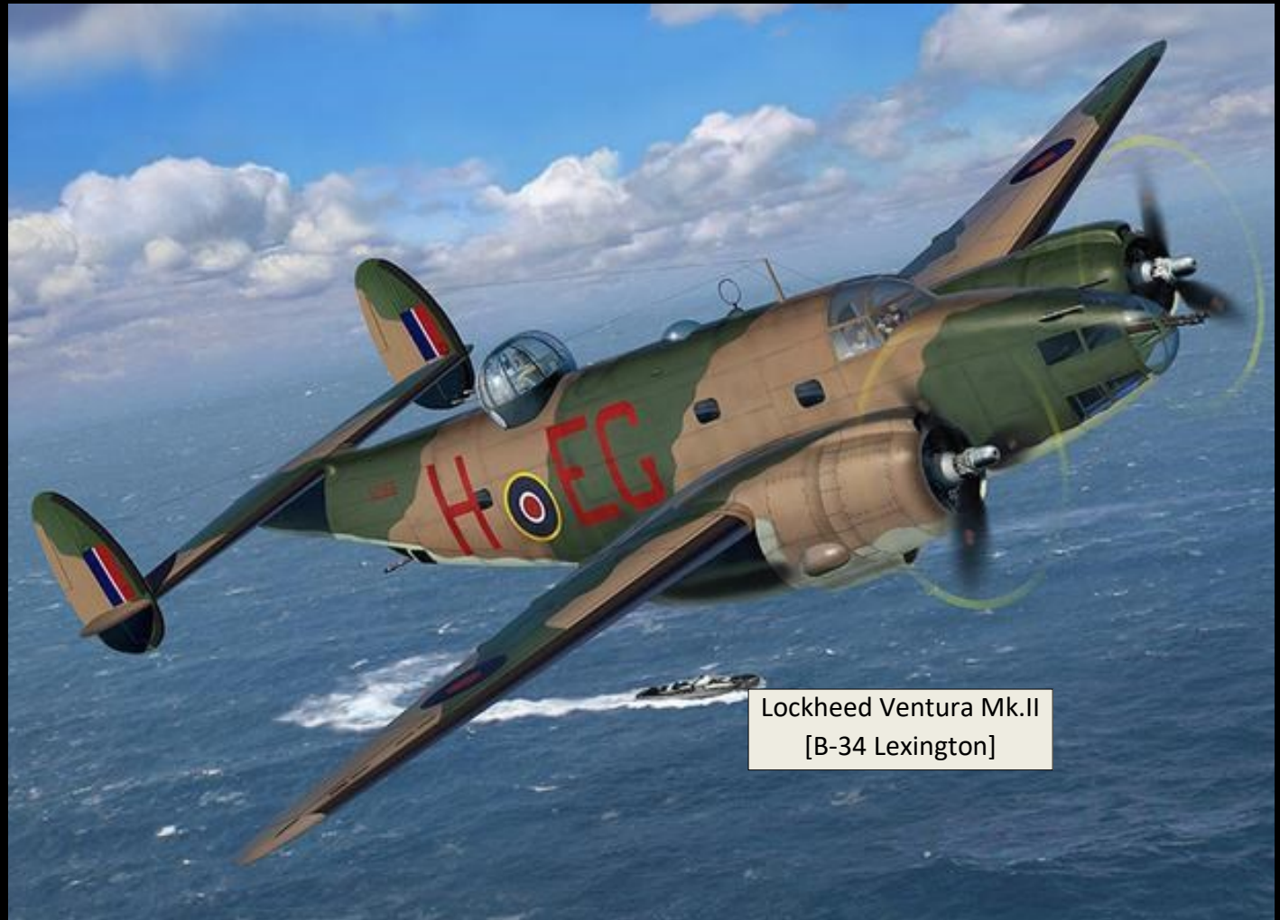
Lockheed Ventura Mk.II [B-34 Lexington]