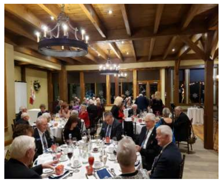
A table of guests mostly from 441 Barrie Wing.