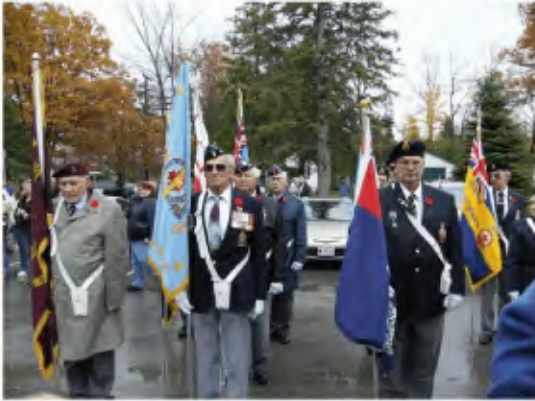
Wasaga Beach Nov 4 th

On November 11 th , I attended the Remembrance Day Services and was honored to lay the WREATH on behalf of the members of RCAF 441 Wing at the Memorial Square. After the parade ended, I accepted invitations to attend the Royal Canadian Legion Branch 147 and to the Army, Navy & Airforce Veterans In Canada Unit 365. Finally I arrived at the 441 Wing in time to hear the Kempenfelt Pipes and Drums giving a great rendition of their excellency in the art of Pipe and Drum music. It was very well received by everyone in attendance and was a proper and fitting way to the ending of this years Remembrance Day at the Wing.